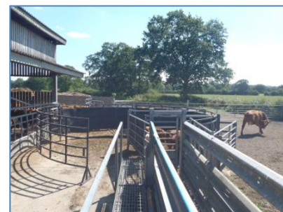
Fig 1. A Good handling system is essential