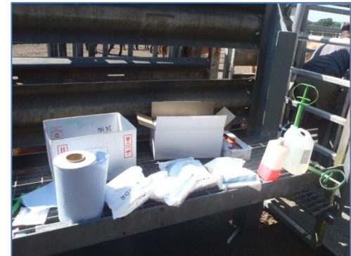
Fig 2. A well organised approach is required in larger synchronisation programmes

There are a number of methods of synchronisation available. In the UK, the two most common ways of synchronisation rely upon progesterone devices (PRID™/ CIDR™) and prostaglandin injections.