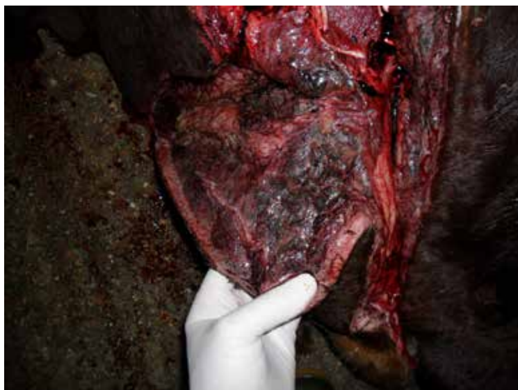
Black leg has characteristic finds on post mortem

A good post-mortem diagnosis is based on the presence of specific lesions that are compatible with a good clinical history. Bear in mind that a fresh carcass will lead to more reliable findings, with putrefaction and autolysis in older carcasses greatly deteriorating the tissues and hiding signs of disease. Some diseases and conditions have non-specific lesions and can be difficult to fully diagnose on PME, such as allergy, post vaccine reaction, stroke, some kinds of poisoning and heart attack.